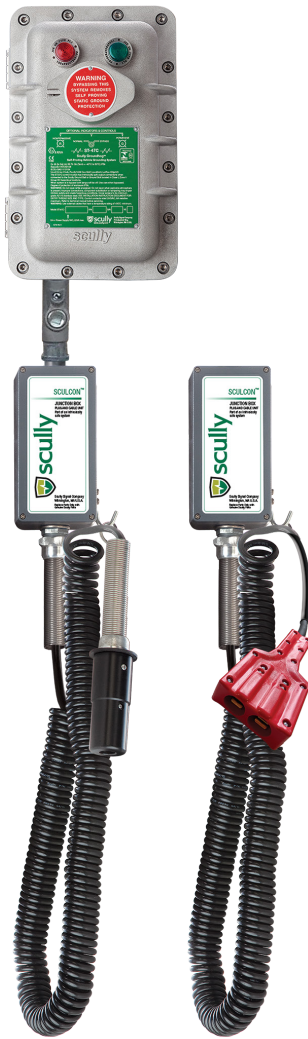
Scully Groundhog Control Monitor with Plug/Cable or with Dual Ground Stud Connector