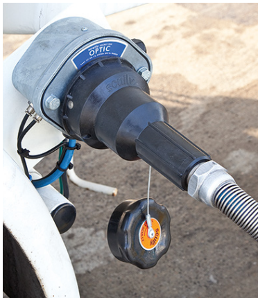
One Connection for Overfill Prevention and Earthing