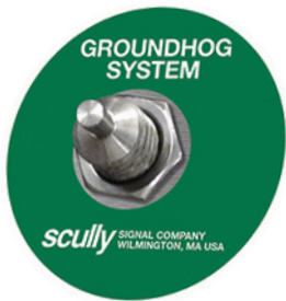
Scully Ground Bolt