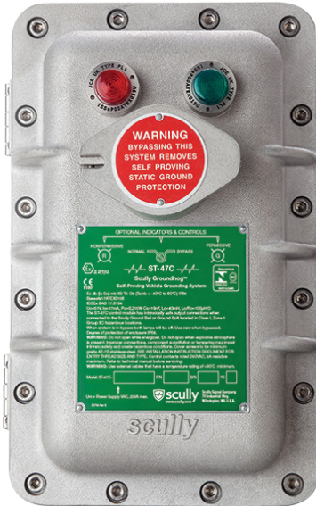
Groundhog Earthing Verification System

Featuring Dynacheck® – Automatic and Continuous Self-Checking Circuitry*