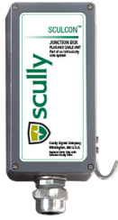
Sculcon Junction Box