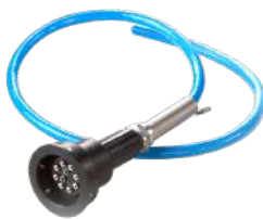
Poly Plug & Cable Assemblies