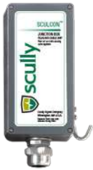
Sculcon Junction Box