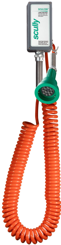
Sculcon Junction Box with Cable Assembly