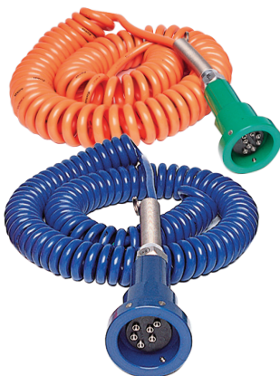
Plug and Cable Assemblies