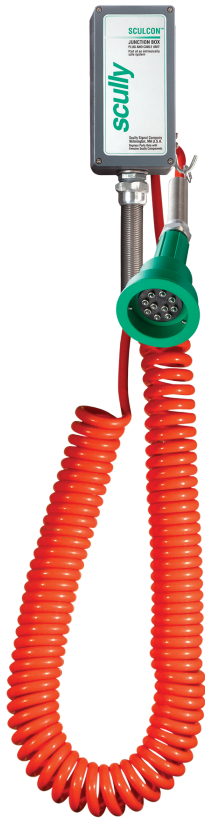
Sculcon Junction Box with Cable Assembly