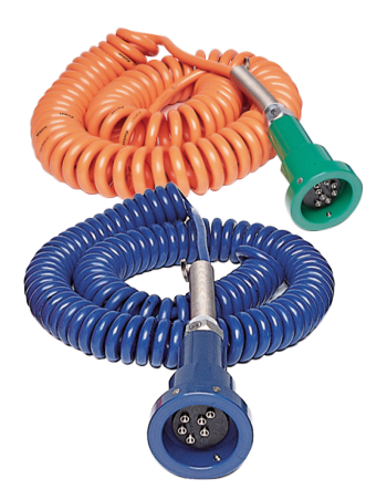
Plug and Cable Assemblies