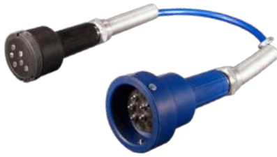
Scul-Gard Break-Away Cable