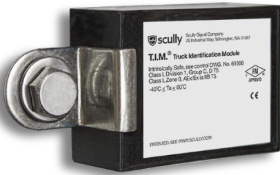
Scully Truck Identification Module ®