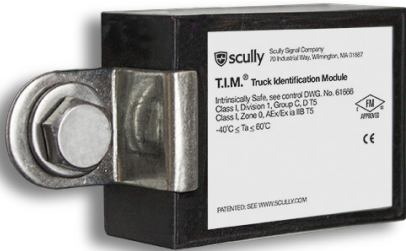
Scully Truck Identification Module ®