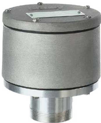
SP-H Holder (for 1–3 sensors)

Featuring Dynacheck® – Automatic and Continuous Self-Checking Circuitry