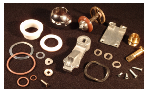
05934 Nozzle Rebuild Kit