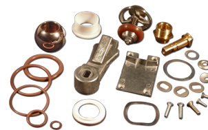
05416 Nozzle Rebuild Kit