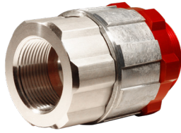
Female COM A Sculflow Swivel

Setting Standards in Safety and Dependability since 1936.