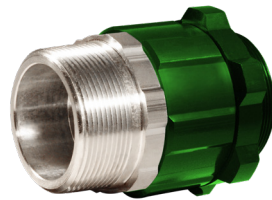
Male COM B Super Nozzle Swivel