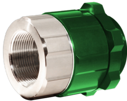
Female Super Nozzle Swivel