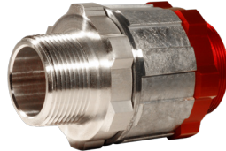
Male Sculflow Swivel