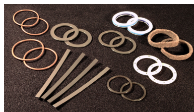
05859 Seal Kit, Swivels for Sculflow Nozzle